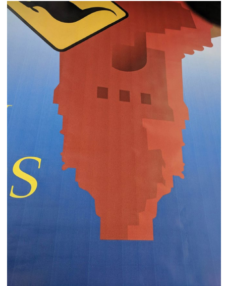
Banding problem shown on a section of a 'mega-light' wide format print before calibration in Global Graphics' PrintFlat software

Macroscopic variations are the banding that you get along a single pass printer or across a multi-pass or scanning printer. The unevenness is caused by variations both within and between inkjet heads along the print bars in the press. This can be caused by: