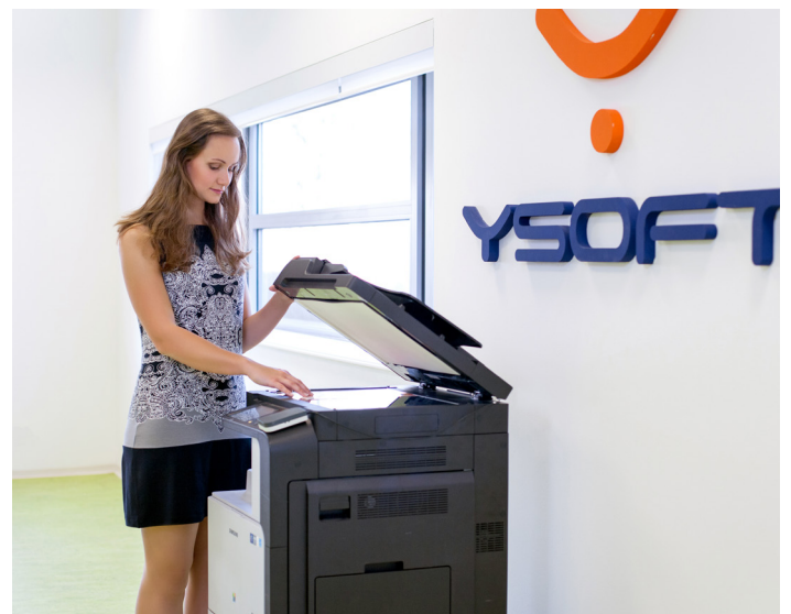
Automated scan workflows remove the complexity of scanning, processing and securely storing digital documents.

Choosing to outsource the work and integrate Mako from Global Graphics Software has allowed the engineers at Y Soft to focus on other priorities, such as delivering the company’s products faster and improving its customer support.