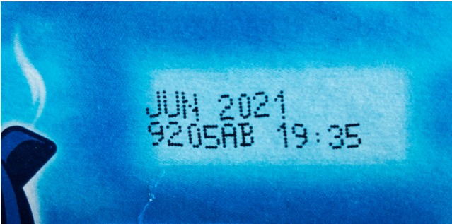
FIG 2: typical print from a coding and marking device

This use of two different printing systems is rather similar to early variable data being printed with a simple digital press on top of a pre-printed shell (usually produced on an offset or flexo press). In some cases brands are deciding that they want the logistics data to be more visually seamless with the rest of the design, which is driving a similar change to that towards “white paper workflows” in the transactional space, where everything is printed in a single pass.