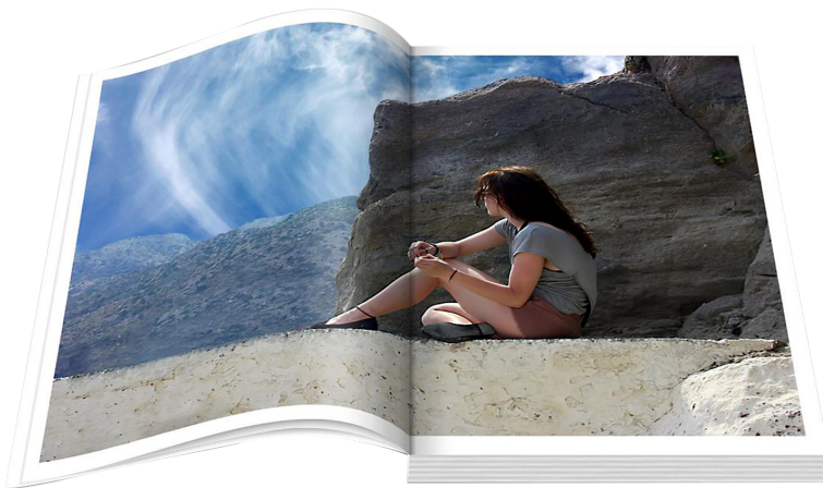
FIG 4: photobooks offer higher margins than simple print finishing

Each individual order, perhaps for one mug with a photo printed on it, may not appear to be variable data printing. But when orders are aggregated at the producer there may be hundreds or thousands of mugs to be printed per day, each with a different image.