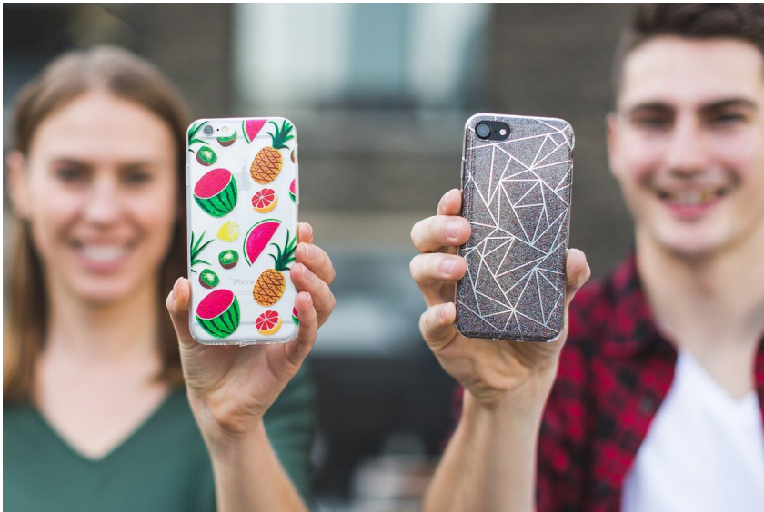
FIG 6: demand for customized product is not restricted to any particular age group

A lot of the demand for this mass customization is ascribed to the changing attitudes and communication preferences of millennials and Gen-Z. To generalize, it's often said that such audiences demand to be treated, and be able to represent themselves as unique, requiring them to be able to obtain unique product in support of that position.