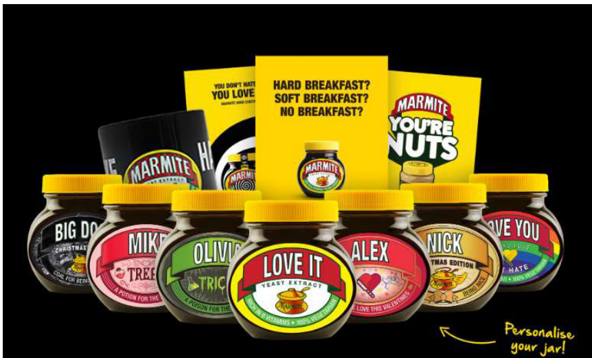
FIG 5: personalized product for gifting can attract a significant premium 12

The most famous campaign for ‘personalized’ labels was Coca-Cola’s “Share a Coke”, but in practice most labels were printed in long runs, randomizing the most common names in each country; only labels from roadshows and purchases from the web were actually printed on demand for specific recipients. This makes it an excellent example of a hybrid model taking advantage of the benefits of multiple print technologies.