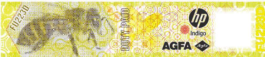
FIG 3: security marking may require high-quality print

Obviously, this convergence is also aligned with anti-counterfeit and track and trace requirements, allowing higher-quality inkjet to be used to convey sometimes-significant amounts of unique data in a small area.